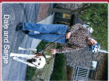
Dale and Sarge

These dogs are doubly trained. We train them to work with people who are blind or visually impaired, and who also have additional disabilities. That's training once as a guide dog, then training again for mobility/service.